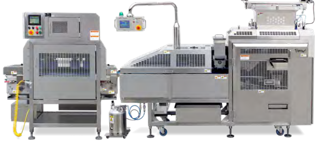
Cup Rounder (SR002)