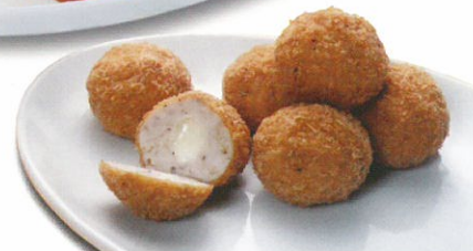
Cheese-filled chicken balls