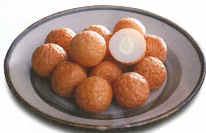
Boiled fish Paste Mayonnaise