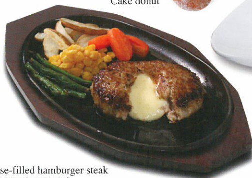
Cheese-filled hamburger steak (with additional forming device)